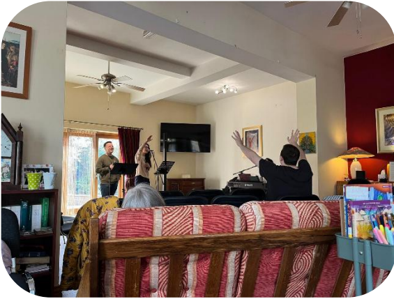
MHOP @ The Ark, Flixton